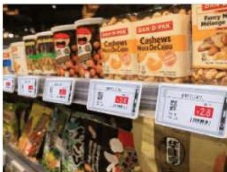
ESL Slide way

Apply to Standard multi-layer board, e.g. general shelf area in store & supermarket