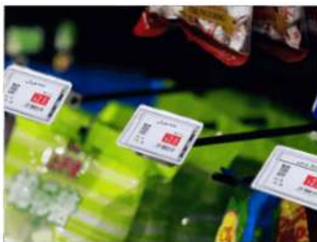
ESL Hanging rail

Apply to Standard multi-layer board, e.g. general shelf area in store & supermarket