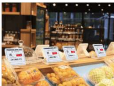
ESL counter Stand

Apply to Seafood and Fresh areas, 1 meter Waterproof