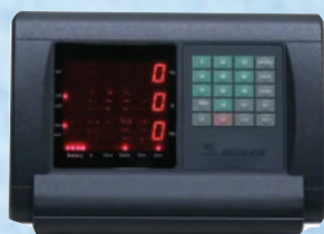
A15 (Price Computing)