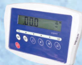
KW (Basic Weighing)