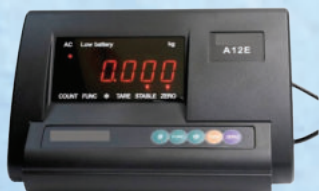
A12E (Basic Weighing)