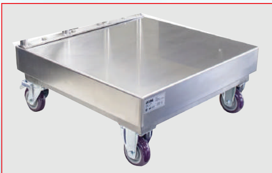
Bench Scale wheels