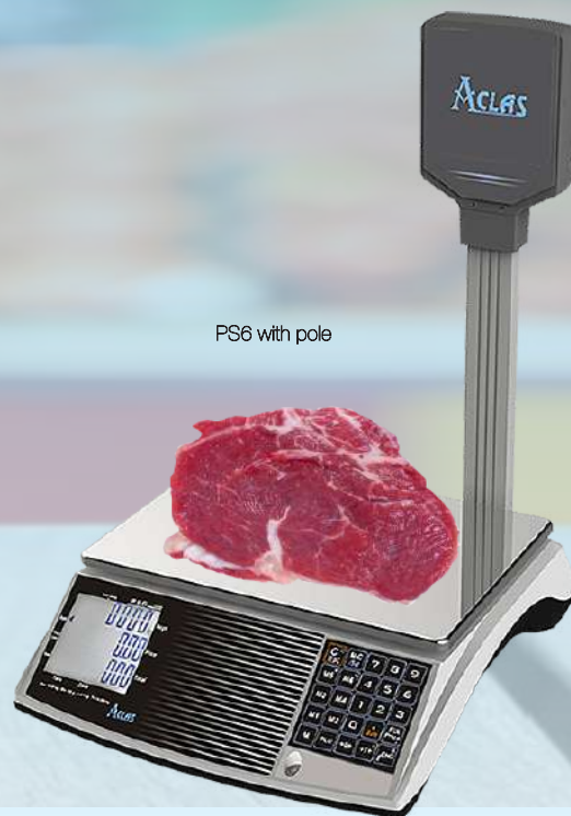
PS6 with pole